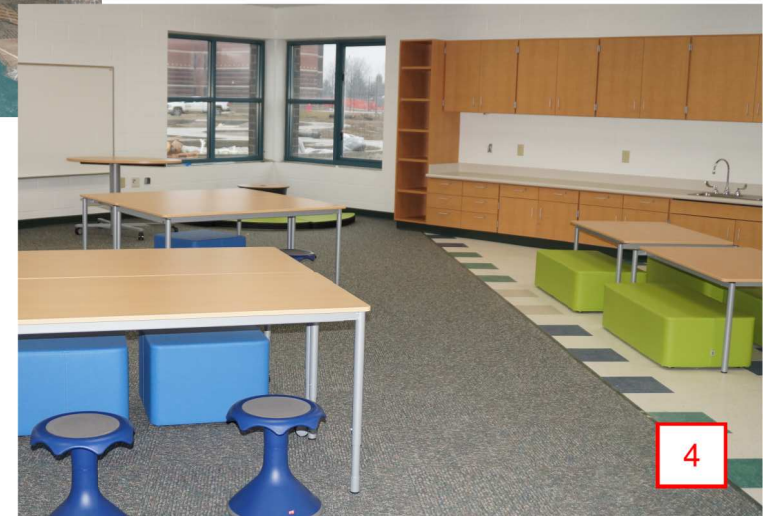
View 1 - Media center from main entry View 2 - Cafeteria ramp to stage area View 3 - Classroom wing corridor View 4 - Typical classroom