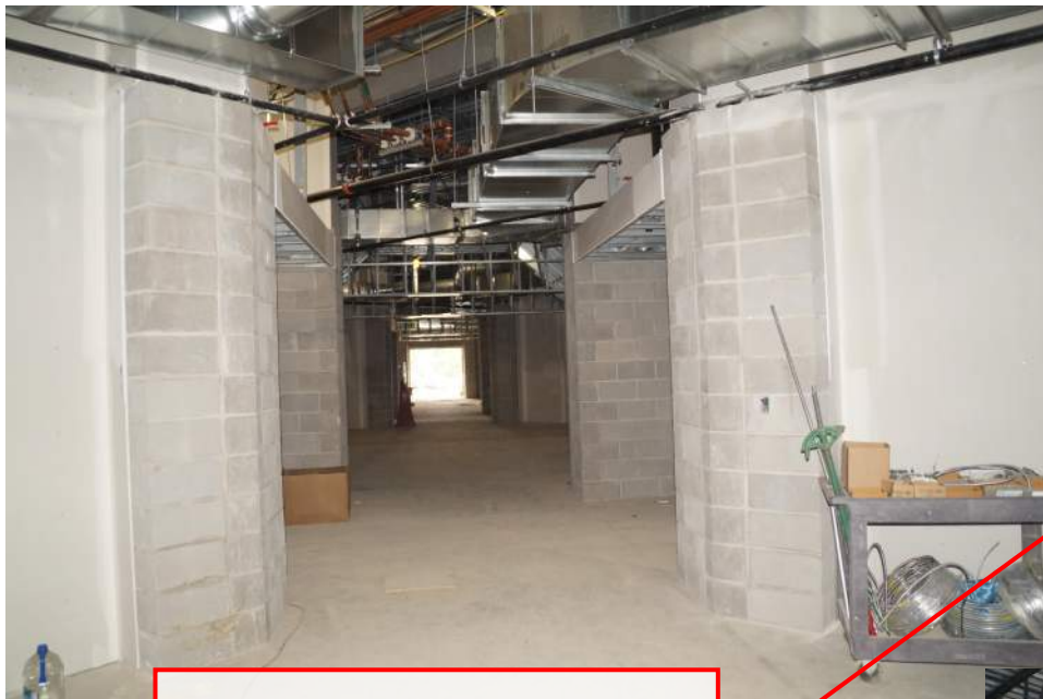
View 1 - Looking northeast along the interior corridor of the northeast classroom wing.