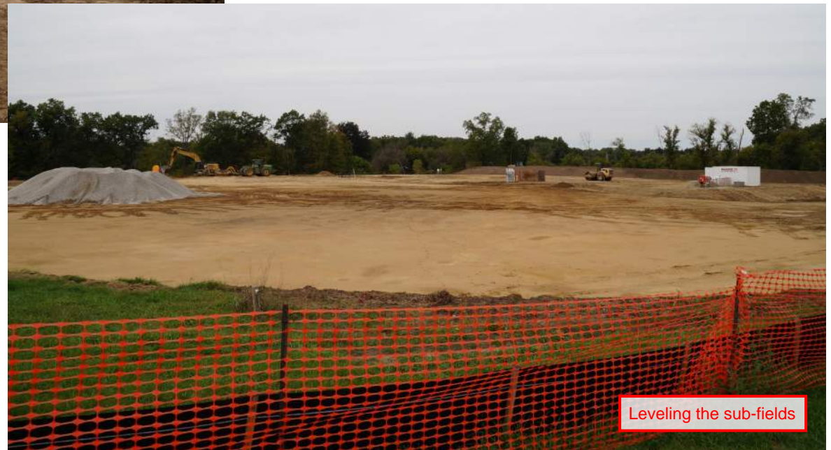
Leveling the sub-fields