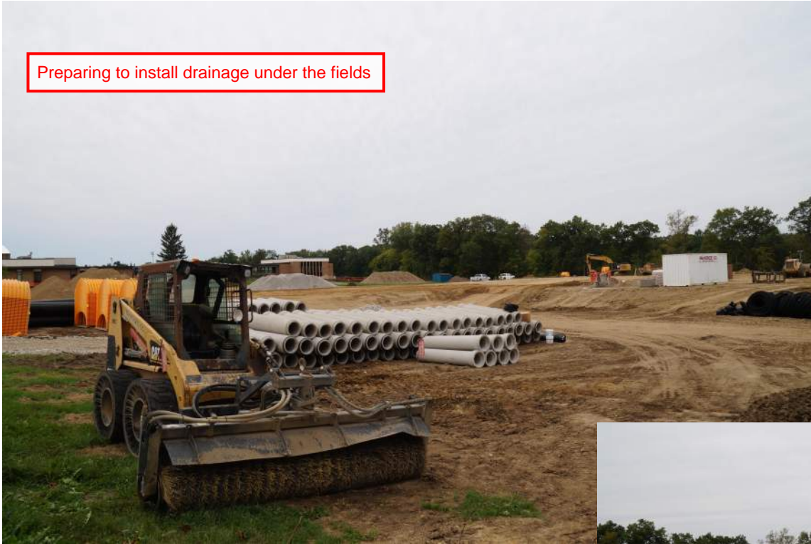
Preparing to install drainage under the fields