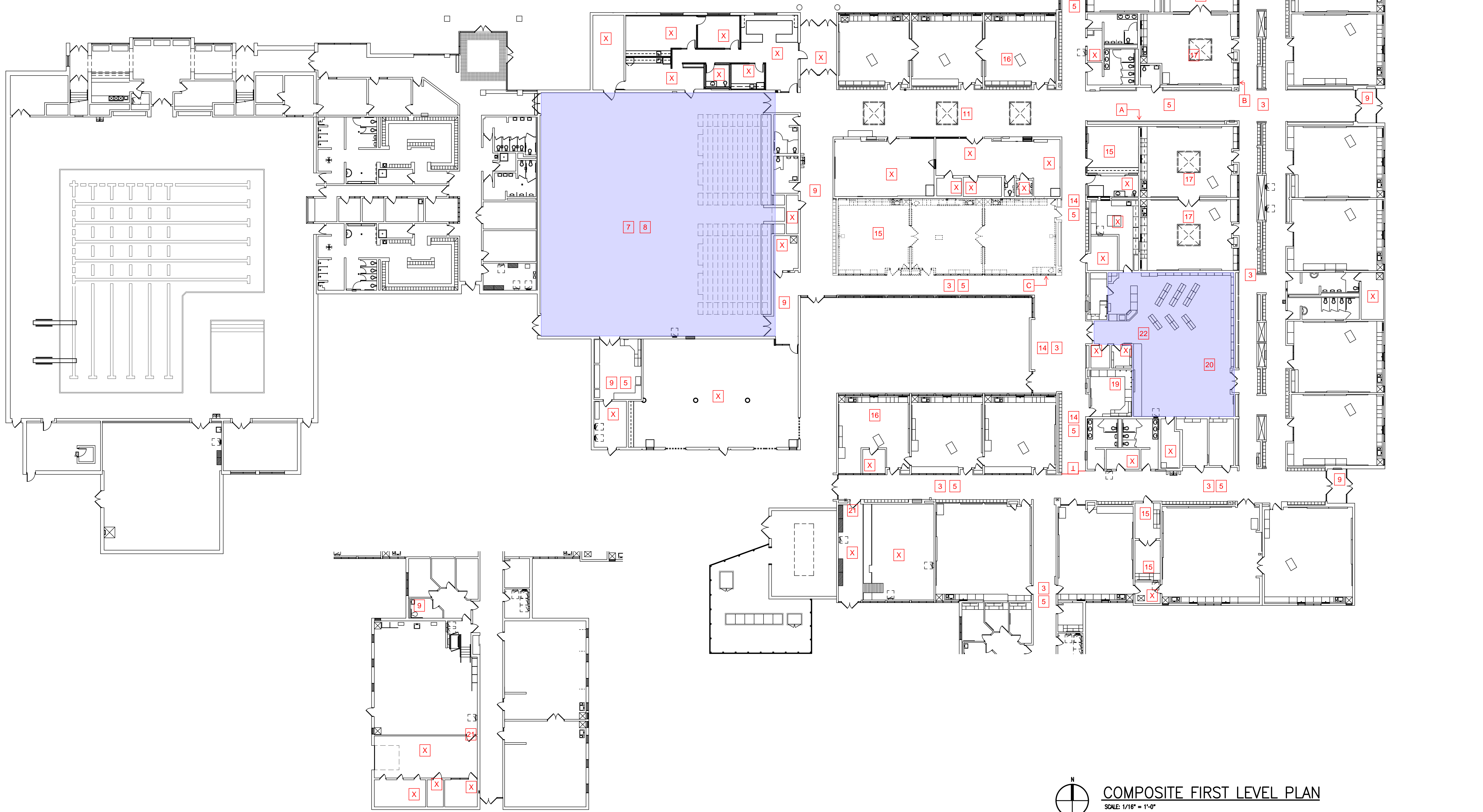
COMPOSITE FIRST LEVEL PLAN SCALE: 1/16" = 1'-0"