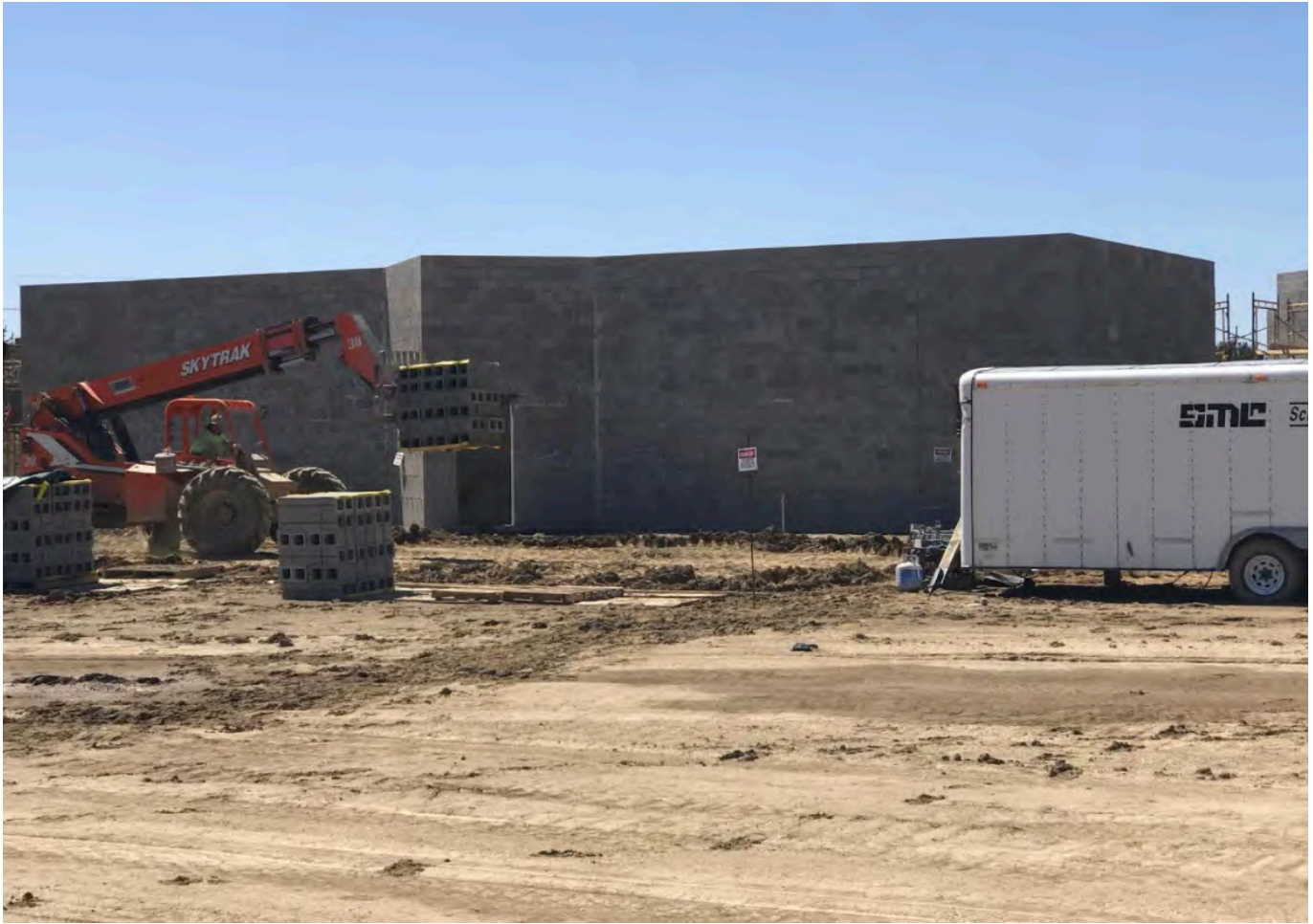
Doorway for New Restroom Accessible from the Playground (Cornerstone will also have a restroom installed for playground access)